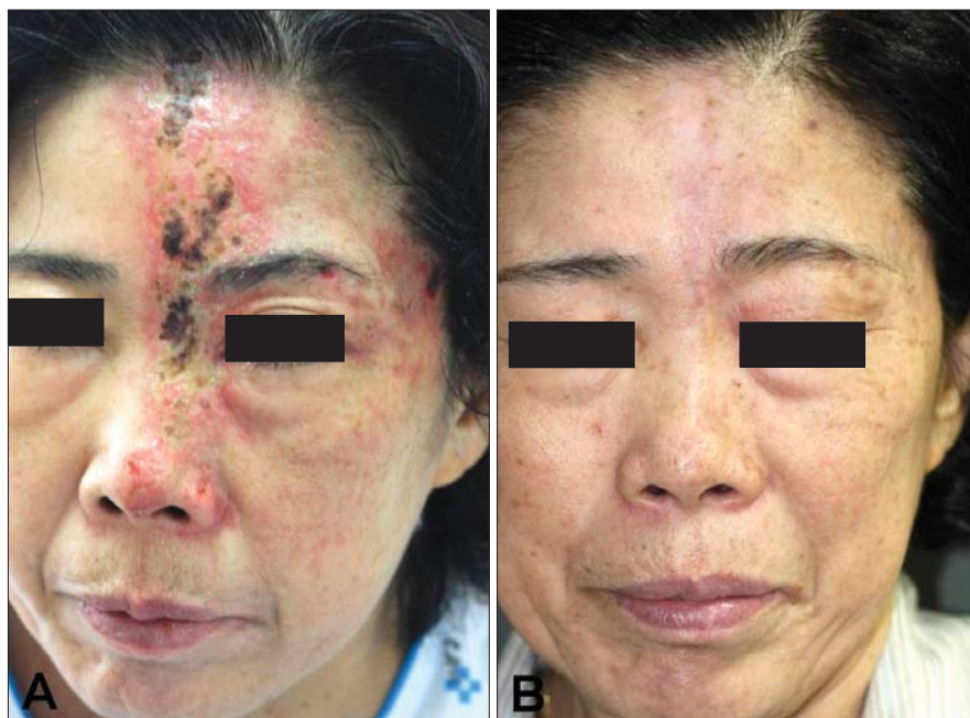
Fig. 4. The experimental group (group B). (A) Grouped vesicles and crust appeared in a unilateral fashion following left ophthalmic division of the trigeminal nerve, involving primarily the left forehead, which were extended to ipsilateral nose at the baseline. (B) 3 weeks after the LED treatment, the skin lesion markedly improved. LED: light-emitting diode.

infrared region of the spectrum (630~1,000 nm), modulates numerous cellular functions. Low-power lasers and LEDs are the well-accepted therapeutic tools for use in the treatment of the infected, ischemic, and hypoxic wounds, along with other soft tissue injuries. At the cellular level, photobiomodulation can modulate fibroblast proliferation and attachment, as well as the synthesis of collagen. Using photobiomodulation, both the accelerated-healing and a greater amount of epithelization in the wound-closure of the skin grafts have been demonstrated in human studies. Findings in the literature also show that the LED therapy is known to support and speed up the healing of chronic leg ulcers, including the diabetic, venous, arterial, and pressure ulcers 3,4 .